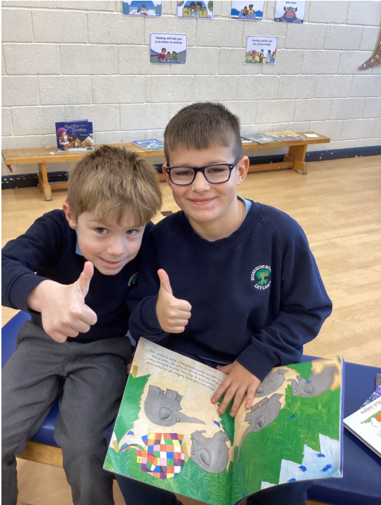
An enjoyable series of Book Café sessions!